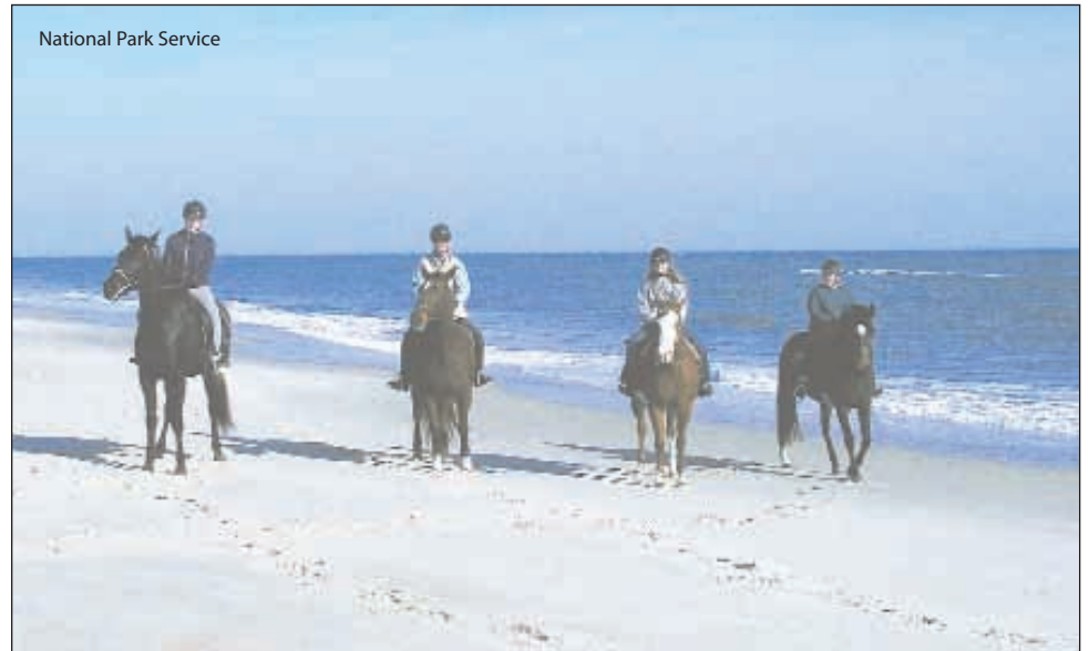
Horses share the beach with humans beginning in early October.

With warm days, cool nights, and no biting flies or sand critters, late summer and early fall is the perfect time for tent or RV camping on the beach, too. The campground at the National Seashore is open all year, although the State Park closes its sites at the end of October. Pets have always been allowed in the National Seashore. This year, the State Park revised its regulations to allow dogs in the park, including one camping area.