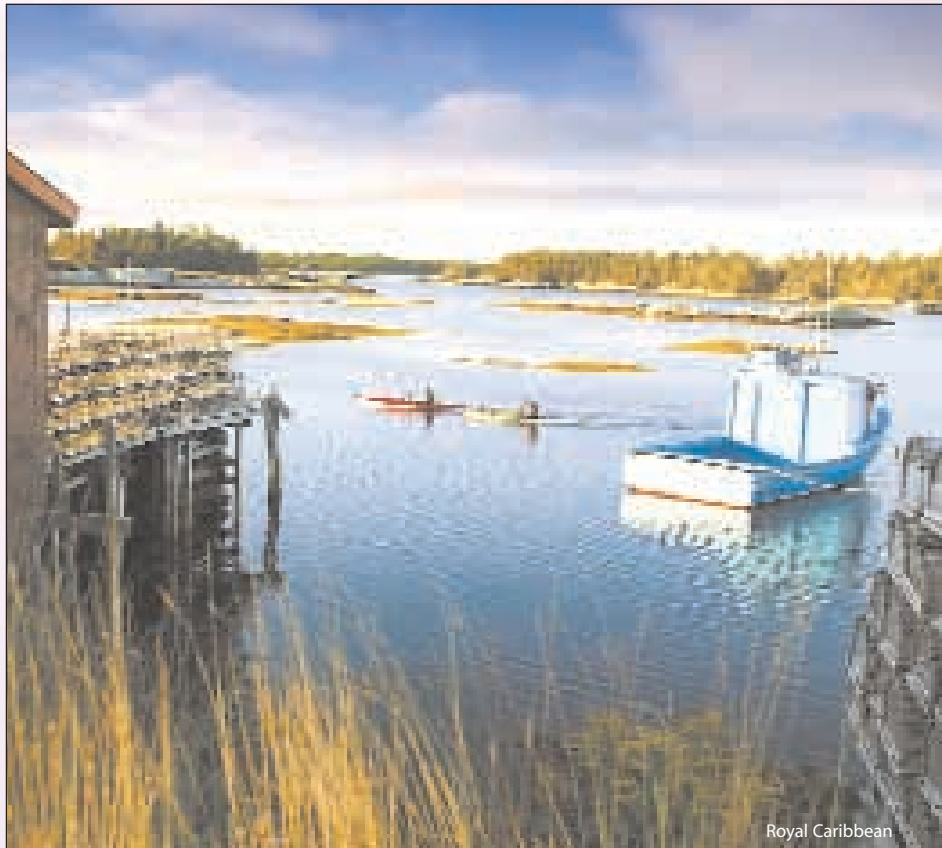
Kayaking is one of many activities in scenic Nova Scotia.