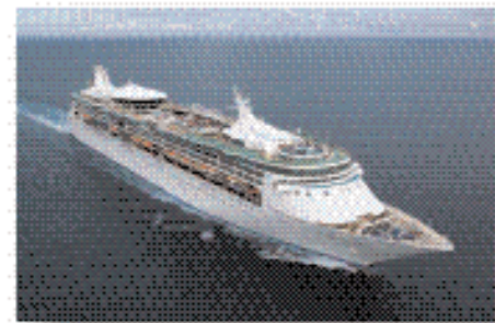
Royal Caribbean's Enchantment of the Seas

Experience the joy of cruising from Baltimore to the Caribbean, Bahamas, Bermuda or Canada/New England.