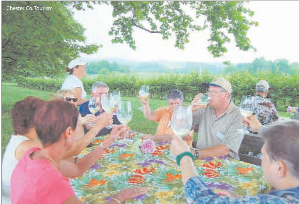
Wine Camp participants enjoy an outdoor lunch at Paradox Vineyards.