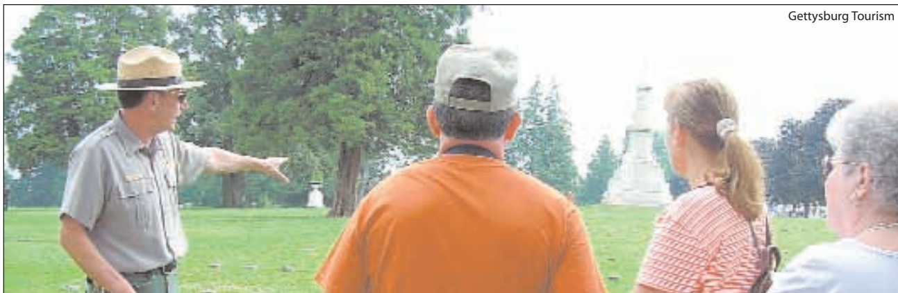
Park Rangers lead tours of the Soldiers' Cemetery, site of the Gettysburg Address. Gettysburg is the northern end of the Journey Through Hallowed Ground.

The Journey Through Hallowed Ground stretches 180 miles along Route 15/20 from Gettysburg, Pennsylvania, to Monticello in Charlottesville, Virginia, passing through a scenic and historically rich landscape that has, according to