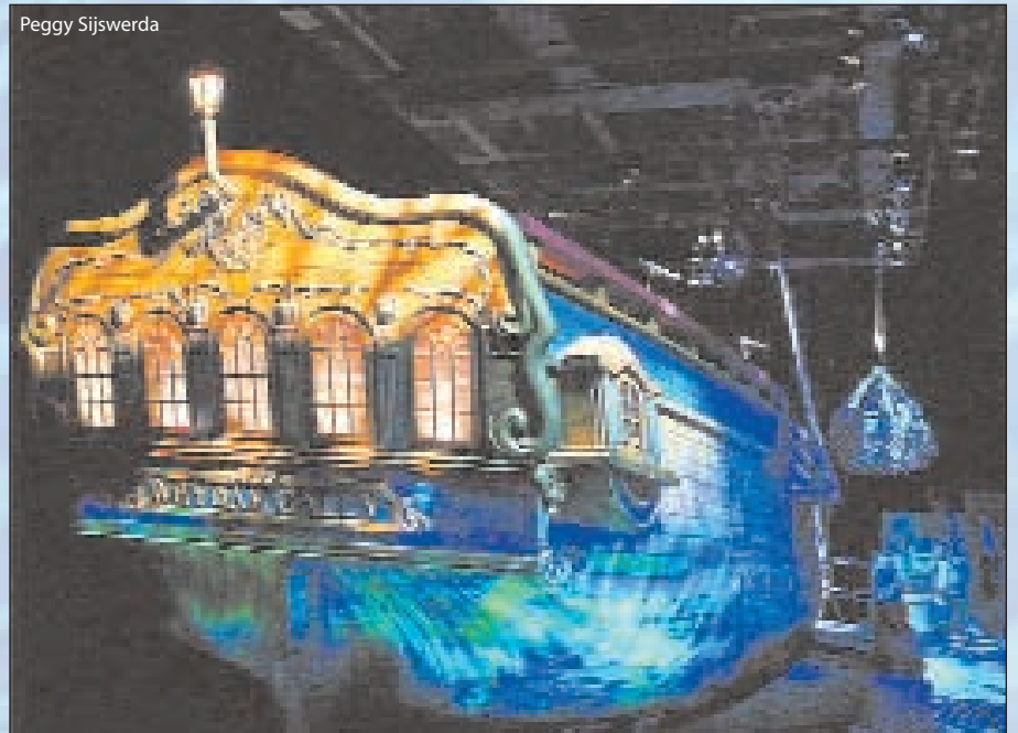
The stern of the Whydah sets the tone for the "Real Pirates" exhibit.

Check out the free travel info on page 35.